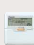
Wired Remote Controller

* Customer needs to choose either wired or wireless.